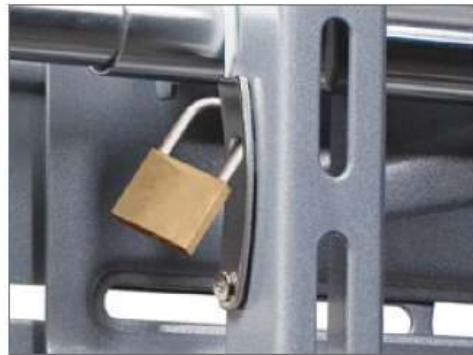
Security option (padlock not included)

NOTE: DEPTH OF UNIVERSAL WALL MOUNT ASSEMBLY, I.E. DISTANCE FROM PLASMA SCREEN MOUNTING PLATE FACE TO WALL MOUNTING BRACKET FACES IS 3.5".