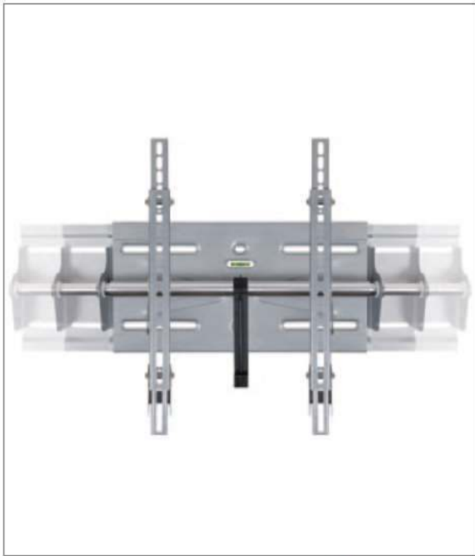
Expandable arms and crossbar accommodates a wide range of screen sizes